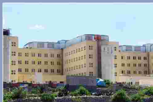
The newly built 'Mater Dei' Hospital 2004. Improved facilities for more than 800 beds and state-of-the-art equipment offer patients the very best in hospital care.

The Medical School within the University of Malta is one of the oldest within the Commonwealth. More than 500 students graduate every year in the medical, pharmaceutical and related fields. Many continue for further studies abroad, a significant proportion of whom have excelled and are now renowned as world-class specialists in their field. Currently the number of medical practitioners registered in Malta is around 1,150.